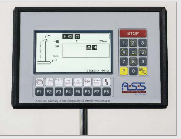
Matching picture of the sewing program