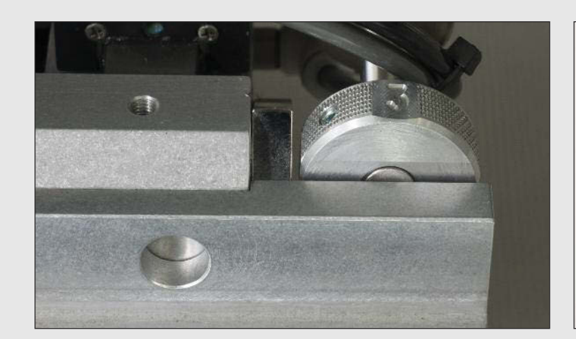
Adjustment of the stitching width using an adjusting wheel