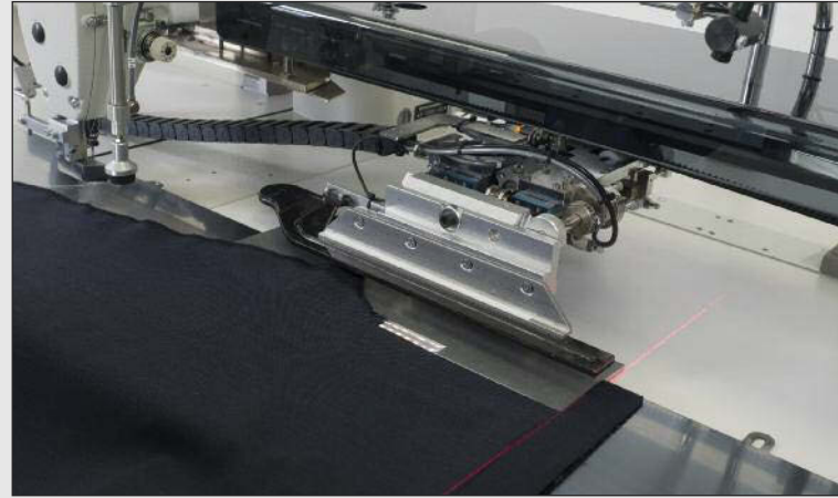
The sewing item positioned exactly in advance by the operator is accepted by the transport clamp