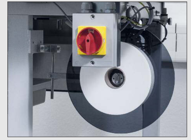
Fleece tape for stabilising the seam runs simultaneously automatically