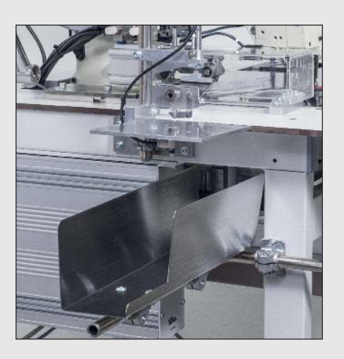
Automatic removal and de-stacking (optional