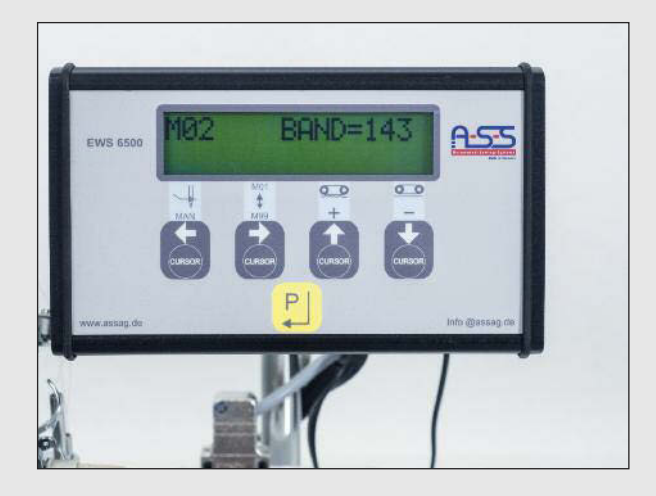
Easy administration and retrieval of the pre-programmed seams via the program controller