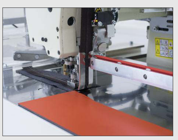
Machine stencil and zipper guide ensure consistent seam quality and guarantee the optimal seam result