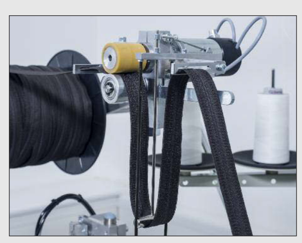
The endless zipper tape is fed automatically via the unwinding unit